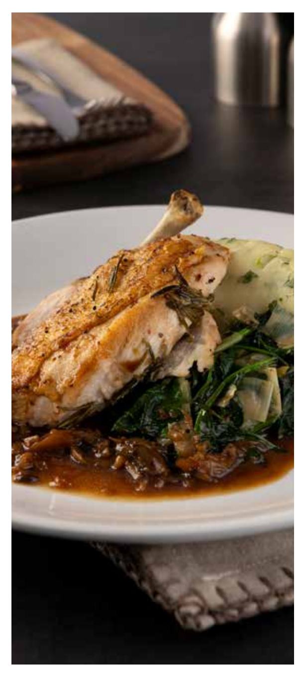
*Set menu per event. 1 x starter/main/dessert N.B. Pre order required two weeks prior to dinner.